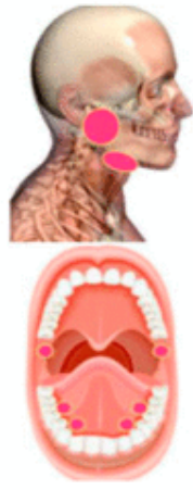
Figure 2 5 PBM treatment area for the...